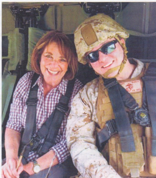
Discussing defense issues on a helicopter in Afghanistan.

Susan made her 12th annual bipartisan Mother's Day trip to Afghanistan to meet with our troops, including the many moms serving far from their families. Traveling with Rep. Martha Roby (R-AL), she also met with women serving in the Afghan military and police force as well as Rula Ghani, the First Lady of Afghanistan.